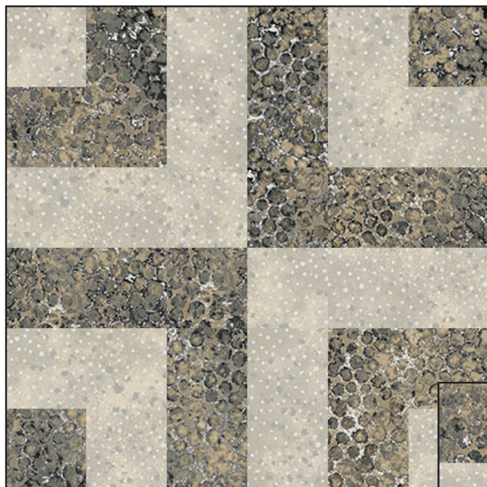
Blocks shown in Shimmer Black Earth 22995M-98 & 22993M-98